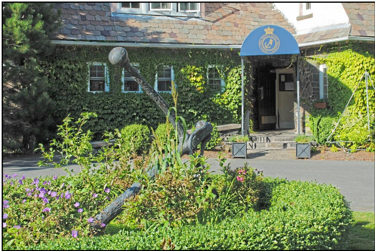
Royal Nova Scotia Yacht Squadron Clubhouse

A full list of yacht clubs that have welcomed our members may be found on our website under the “About us” tab and then by clicking “In the News.” Membership does indeed have its privileges.