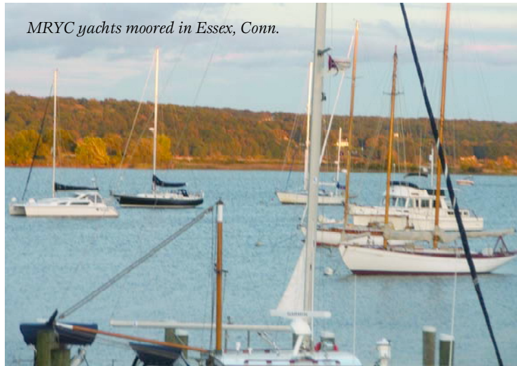
MRYC yachts moored in Essex, Conn.